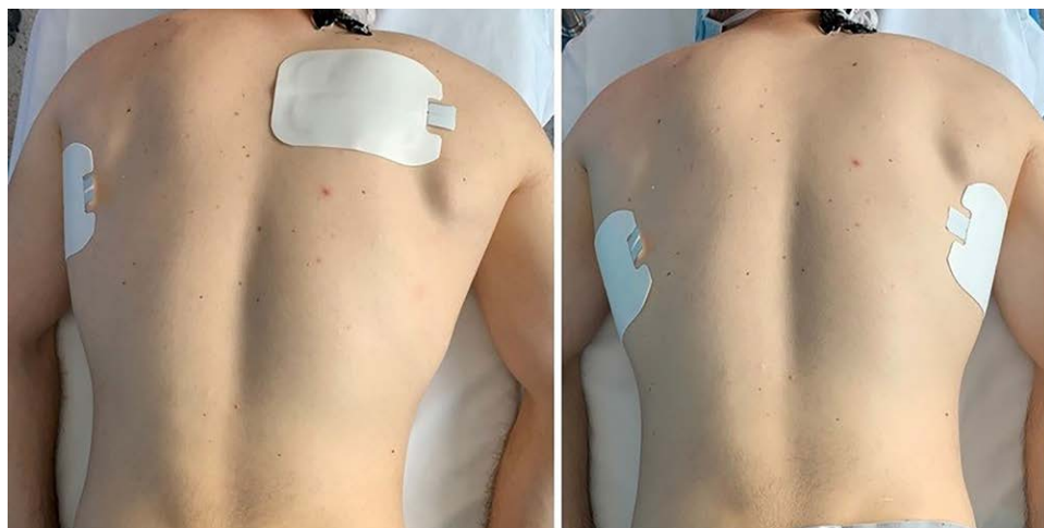
Figure 3. Location where defibrillation pads should be placed in the prone position.

Observational studies and case reports included in this systematic review suggest that basic CPR and