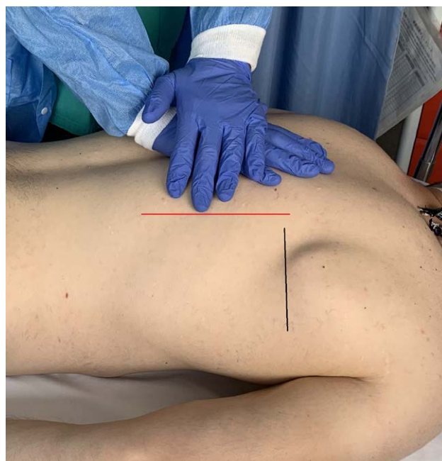
Figure 2. Location where compressions are recommended to be performed in the prone position. Red line represents location of compressions. Black line represents inferior scapular limit.

For prone CPR, landmarks for hand placement used during supine CPR are obviously ineffective. However, a 2017 imaging study determined that